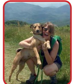
Now that BRHS treated my respiratory infection, digestive disorder, and heartworm, I am able to enjoy hiking the beautiful WNC mountains with my new mom.

BRHS is very happy to help our community families and their beloved pets be well and stay together. But we cannot provide these services without your generous support.