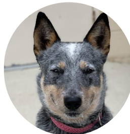
Asher Adopted in February