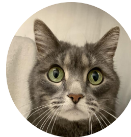
Tinkerbell Adopted in January