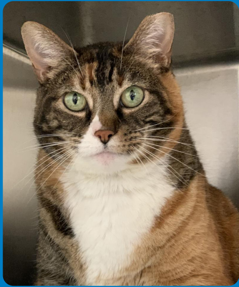
Sally, one of many animals saved through the partnership between HCASC and BRHS.

In the midst of the COVID-19 crisis, it has been more important than ever for community organizations to help each other. Did you know that Henderson County Animal Services Center (HCASC) on Stoney Mountain Road has worked with Blue Ridge Humane Society (BRHS) for years in coordinating the joint mission to save homeless animals?