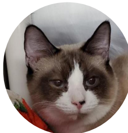
Weston Adopted in February