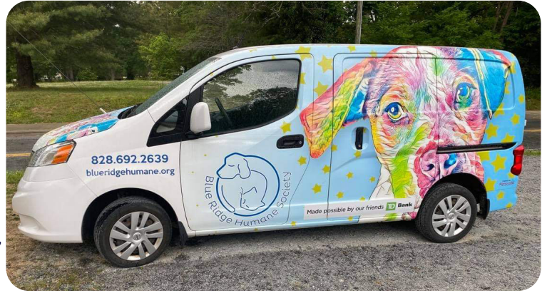
The Community Outreach van is more than just a means of transportation. It means access to pet care and socialization, food, medication, and an increased quality of life for Meals on Wheels clients and their pets.

TD Bank has a long-standing history of supporting its customers, colleagues and communities through events, programs, projects and activities that make a positive local impact. Blue Ridge Humane is grateful to TD Bank for their partnership in this invaluable program that helps keep pets healthy and in their owners' homes.