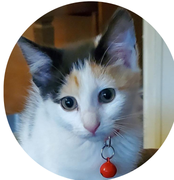
Belle Adopted in July