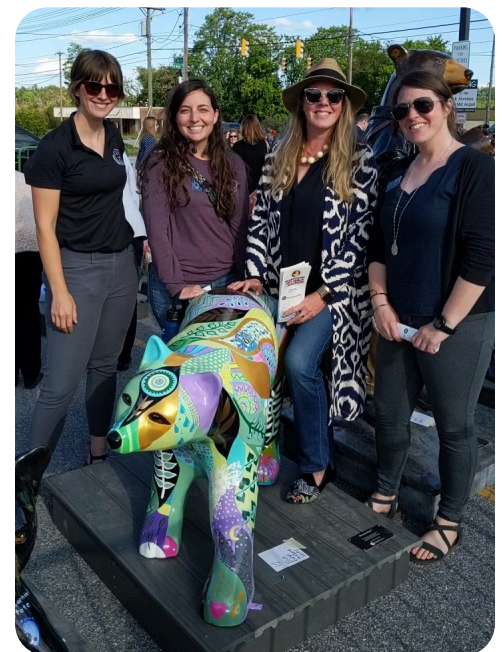
Botanical Bear was sponsored by Wag! A Unique Pet Boutique as part of the Historic Downtown Hendersonville Bearfootin' Art Walk. "Bo Bear" can be found through early October between 2nd and 3rd Avenues in Hendersonville, in front of Wag. She'll be auctioned off in October to raise funds for BRHS and the downtown program.