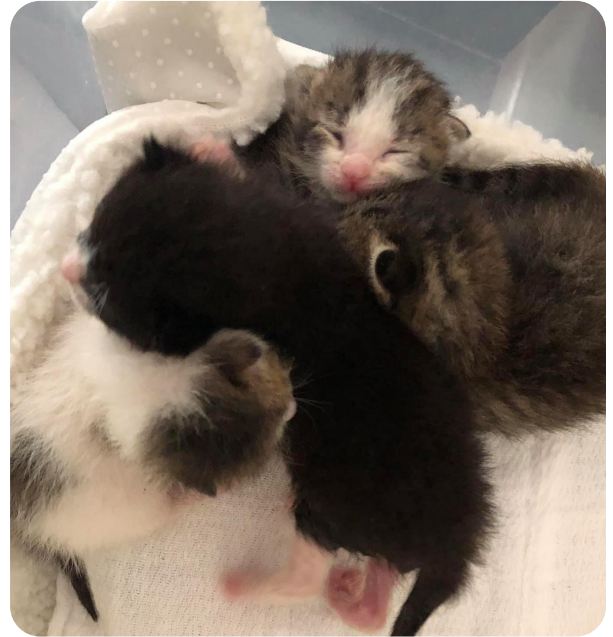
A litter of 9 day old kittens naps while in Charleen's care.

Over the last three years, there has been an average of 340 kittens cared for by Blue Ridge Humane fosters, with 154 YTD in 2021 alone. Fosters like Charleen and the rest of Blue Ridge Humane community give each a chance at not only surviving but thriving, taking the zero percent survival rate if left on their own to almost a 100% guaranteed chance at growing up healthy and strong.