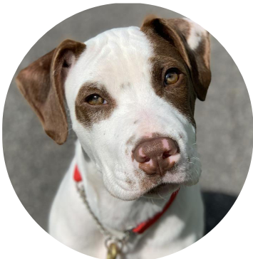
Tommy Adopted in April