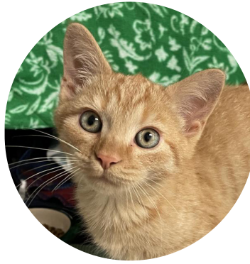
Marnie Adopted in October

Spay/Neuter surgeries through the SNIP program with 824 rabies vaccinations administered