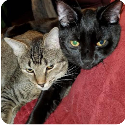
Clover and Sham cuddle together after a fun playtime. Both cats are ready to find a new family on our Rehoming listing.