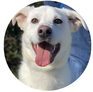
Mouse Adopted in October