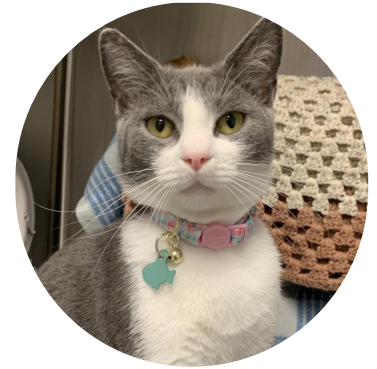
Jingles Adopted in December

“When you think of BRHS, you probably think of adoptions, but what we do for our community is so much more. If we solely focus on adoptions, we are only concentrating our efforts on the symptoms of larger problems facing animals in our community. As an animal welfare organization, we are taking a step back to look at the big picture. With our Community Support Services and post-adoption initiatives, Blue Ridge Humane is tackling the root of issues facing pets right here in Henderson County. By taking a holistic view of how we can better the quality of life for ALL animals, we are affecting change like never before. Unfortunately, the problems facing animals in our community will not be fixed in one year or even ten years. However, with your help, we continue making each year better than the year before.”